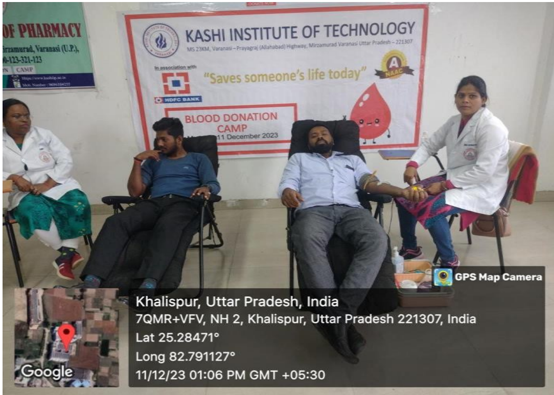
Khalispur, Uttar Pradesh, India 7QMR+VFV, NH 2, Khalispur, Uttar Pradesh 221307, India Lat 25.28471° Long 82.791127° 11/12/23 01:06 PM GMT +05:30