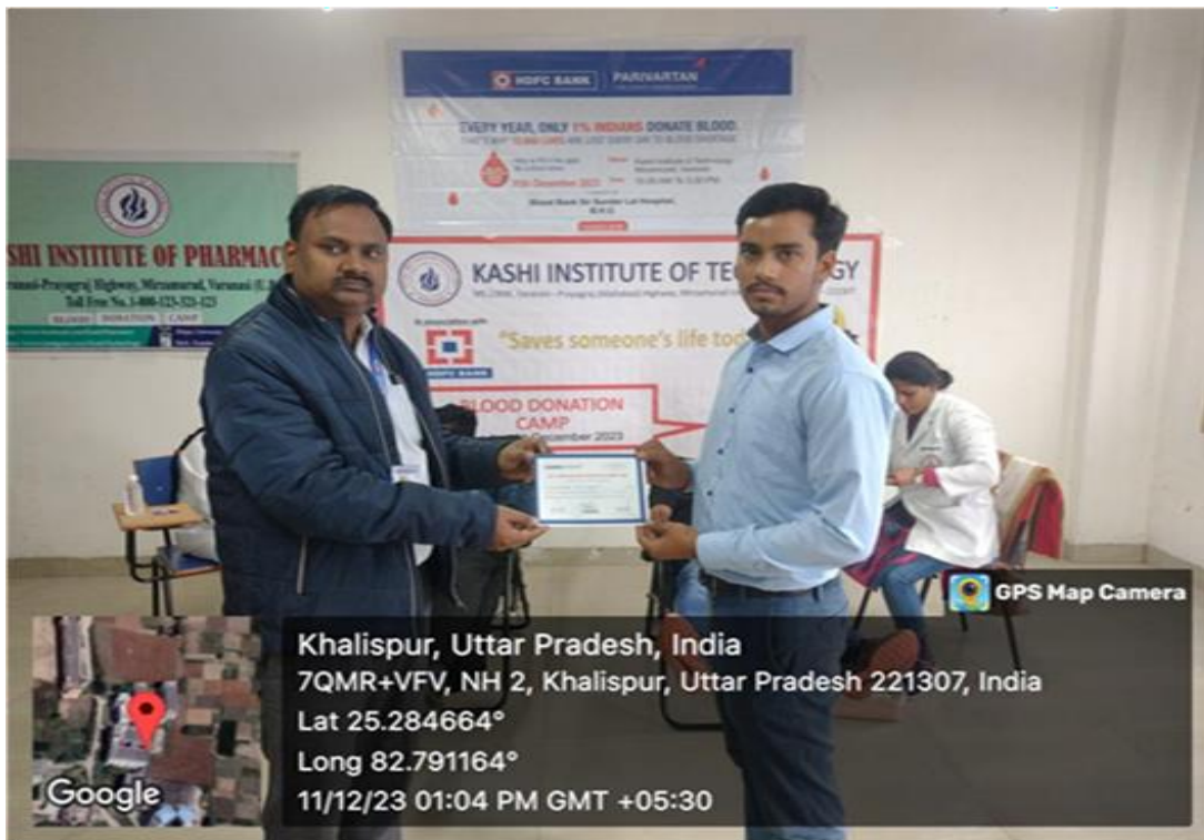
Khalispur, Uttar Pradesh, India 7QMR+VFV, NH 2, Khalispur, Uttar Pradesh 221307, India Lat 25.284664° Long 82.791164° 11/12/23 01:04 PM GMT +05:30