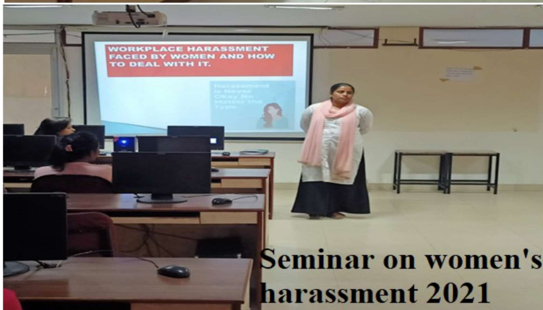
Seminar on women's harassment 2021