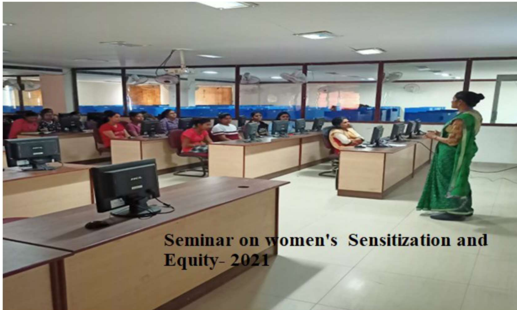
Seminar on women's Sensitization and Equity- 2021